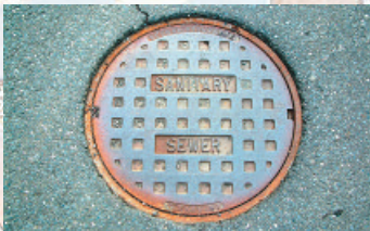
Sanitary Sewer Manhole

The Sanitary System is designed to collect and convey wastewater and is not meant or designed to remove storm water runoff or ground-water which may find it's way into yards or basements. Manholes marked with "SANITARY SEWER" on the lid are for wastewater, while grates are associated with storm water collection: